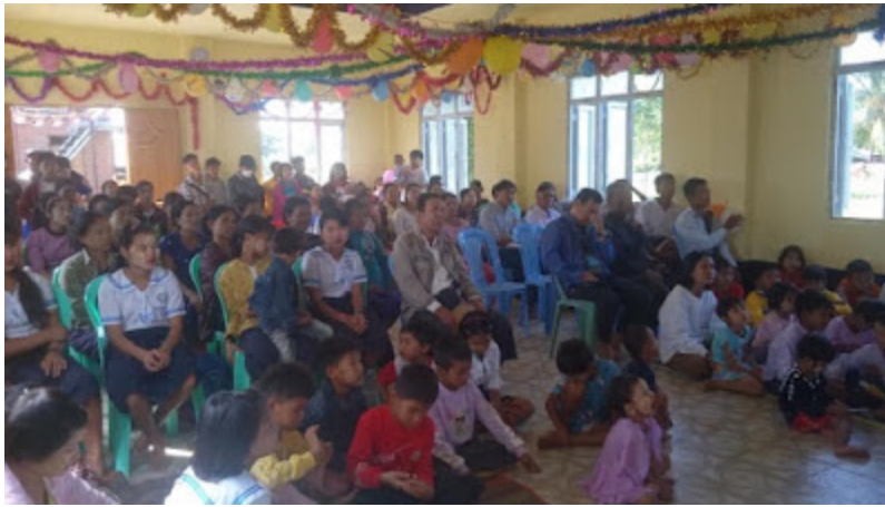
Christmas Celebration in my Church.