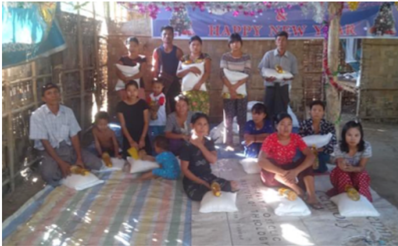
The Needy Families with Rice and Cooking Oil.