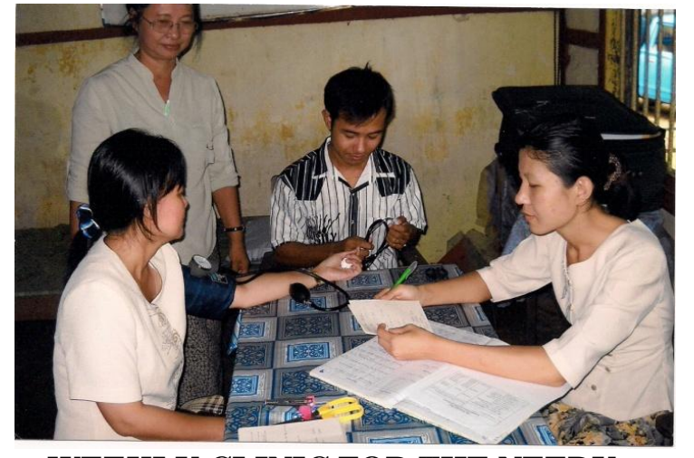
WEEKLY CLINIC FOR THE NEEDY

Patients are given free medicine at the Myo Bible School as part of the weekly ministry. There is no financial support for this ministry which meets a deep need.