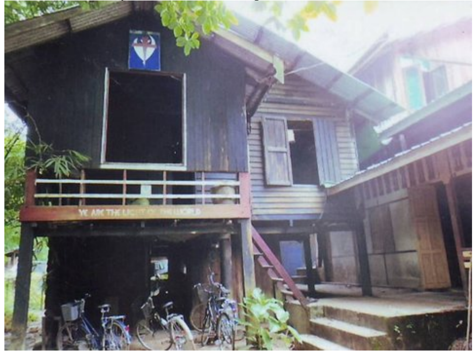
Pathein University Christian Fellowship Women's Dormitory

8. Many church members help tutor the orphans and so, some score high enough they could attend university if there were scholarships for them. Cost varies from $300 to $600 per year.