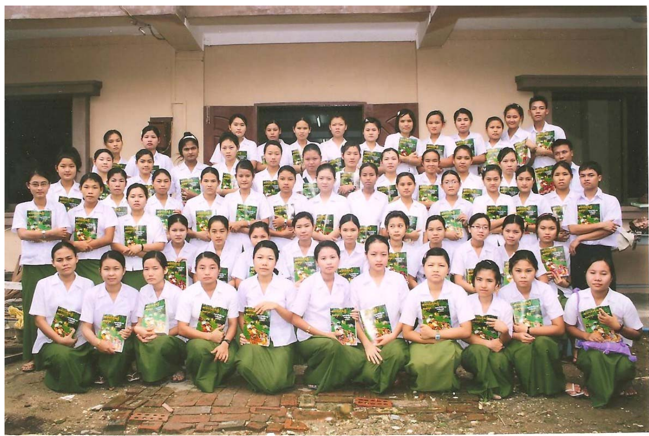
Sakhan Tha Health Training Center trainees holding "Where There Is No Doctor" book.

Please go to friendsofburma.org to learn more.