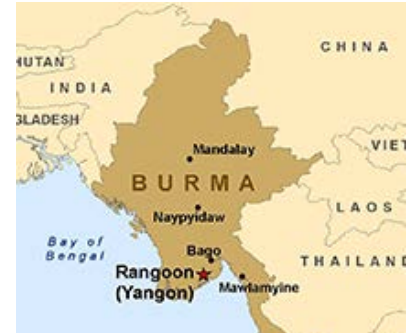
Villages mentioned are north of Rangoon (Yangon) in a mountainous area.

For a video and full transcript by Russ Kadoe of this ministry trip into a difficult to access area see inside blog of the FOB website at http://blog.friendsofburma.org/ We share below brief edited insights from Russ's report.