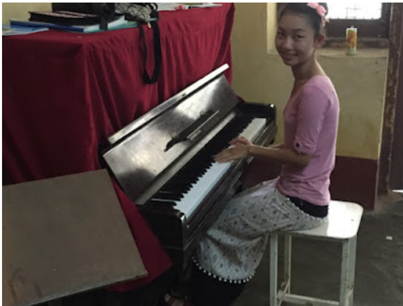
A CMD student practicing piano

There are ten used pianos for students to practice and take lessons. Thramu Ta Mla Paw is hoping to get an electronic piano (please see the Wish List).