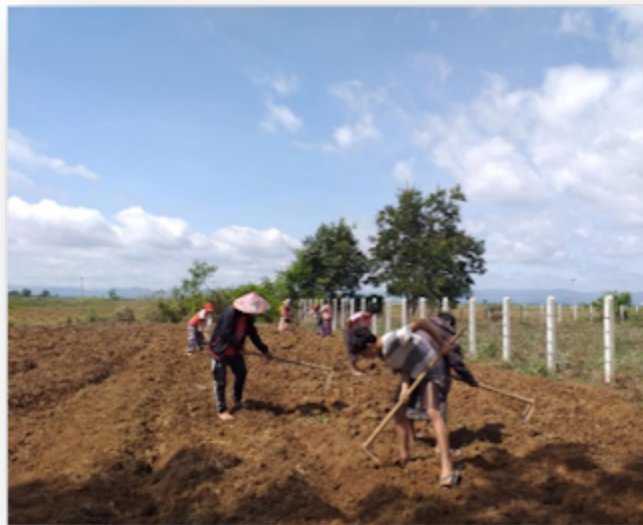
Relief and Rehabilitation Committee for Chin IDPs (RRCCI)