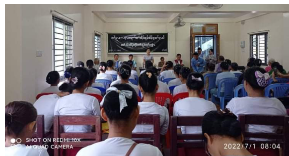
Nursing Aid Training Reopening