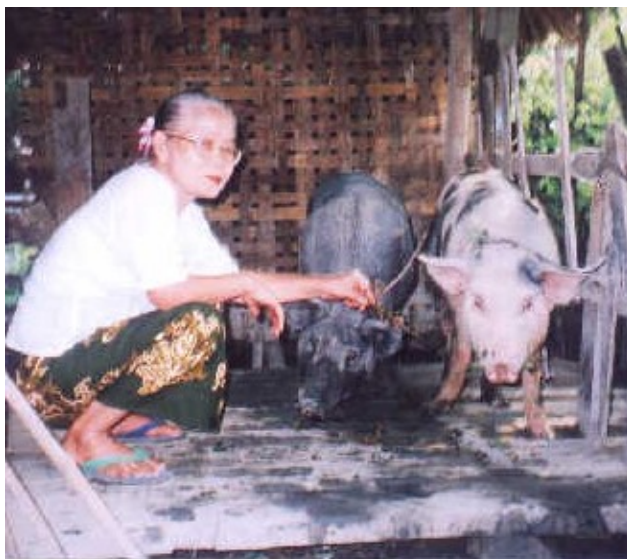
Entrepreneur with her pigs.

Thirteen volunteers of Friends of Burma met in Scottsdale, AZ on Feb. 4, to develop a permanent organizational structure. They voted to form an Executive Committee of sixteen who will make decisions regarding new policies and programs. They also have the responsibility of filling vacancies. There was a positive spirit in the meeting, a lot was accomplished and good fellowship was enjoyed. A final draft of the Bylaws of FOB is being put together and is available to anyone who wishes to see it and make suggestions. All members of the Executive Committee serve without compensation or travel expenses as do all volunteers in the U. S.