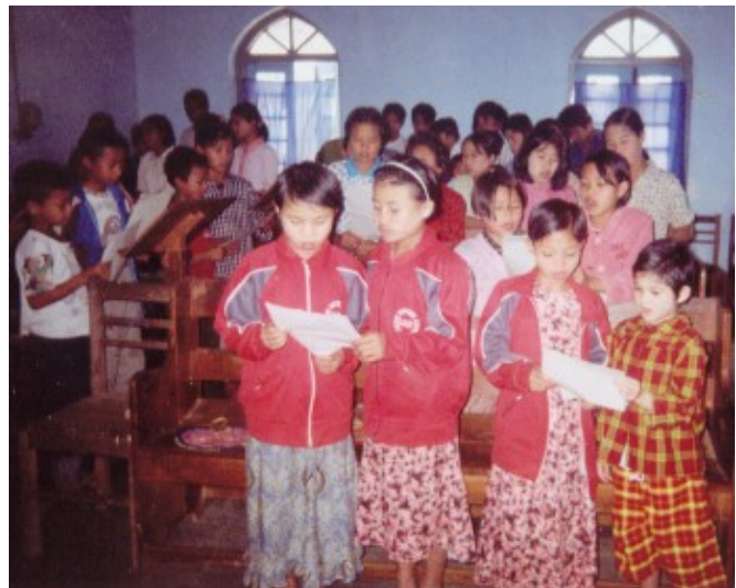
Agape orphans singing.