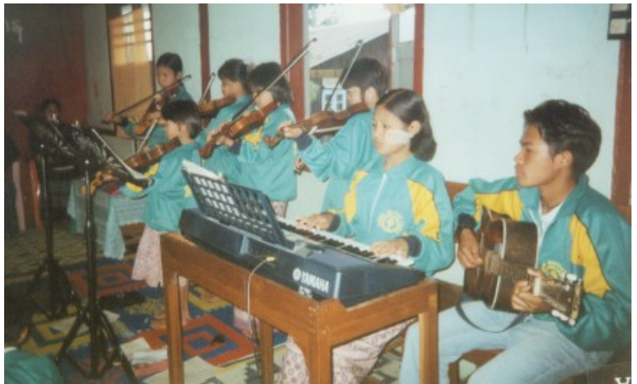
Orphans with musical instruments.