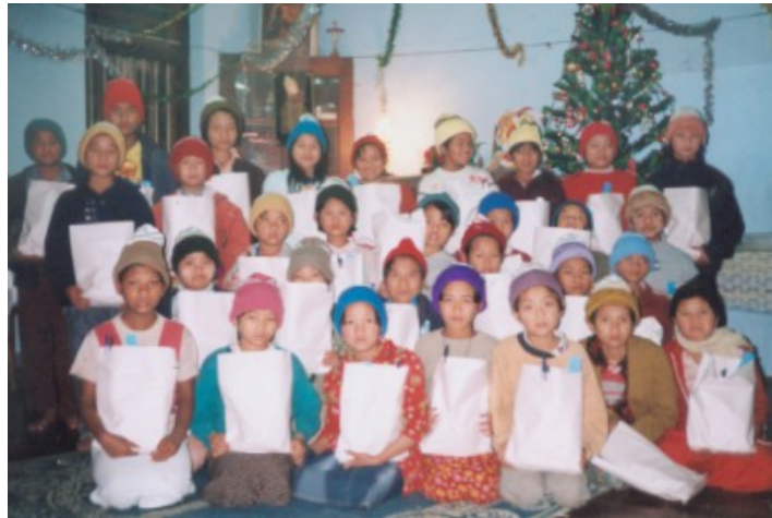
Children with Christmas Sacks.