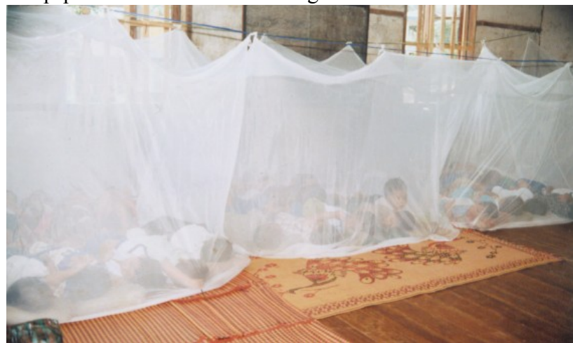
Nursery School with FOB given mosquito nets