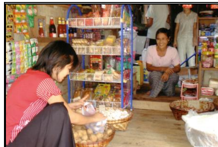
Grocery store is opened by a beneficiary family with all essential items for sale to support the whole family.

One of the beneficiaries is a nursery teacher from Tontay who received a loan to raise cows. Initially she was not able to support her family with her sole income. She now has two cows, which are trained and will soon be able to work in the paddy field.