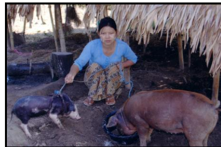
As one pig grows big enough to be put on sale, another piglet is brought in for breeding.

In addition, the grant was also used to support two widow head of households who agreed to raise ducks and pigs. Micro finance activities in the Ayarwaddy Division area was hard hit by Cyclone Nargis. Three beneficiaries from Thabyay Kyine village lost their lives.