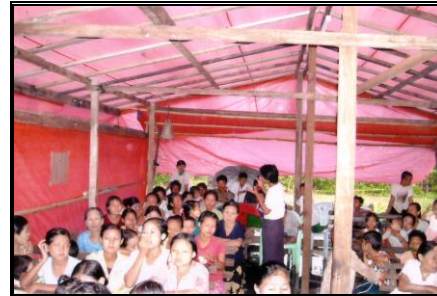
Psychological and social support session in progress for Cyclone Nargis victims.

With the grant fund received from FOB in 2008, a psychological and social support program was provided at Cyclone Nargis affected areas.