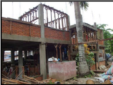
The long awaited new KBC Healthcare Clinic is now under construction and progressing very well. The final completion of the building is scheduled for the end of August 2009.