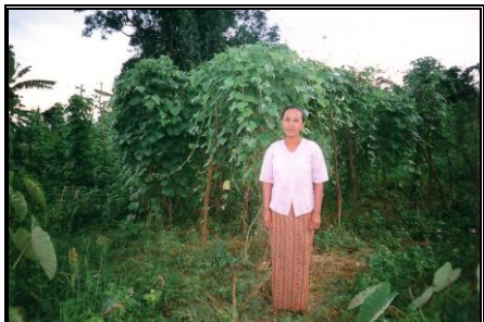
A proud and successful beneficiary from growing seasonal crops stands in front of her garden.

The number of beneficiaries of KMBWA has remained the same for the past two years. The main income for the beneficiaries has been from agriculture and livestock and loom projects with the grants secured from FOB.