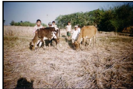
Cows bred by a beneficiary are being trained to work in the paddy fields.

NWA is seeking support to send local girls to Yangon for sewing vocational skill training