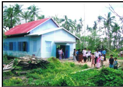
The Bangada Church where a miracle happened during Cyclone Nargis.

The newly built Bangada Church was yet to be dedicated when Cyclone Nargis hit. Despite knowing that the main doors were locked, villagers came to the church in the dark at midnight because of the strong and high tidal waves. The church doors opened and villages were able to come into the church. Three strong men tried to shut the door but without success. The doors stayed opened to allow and save more villages to come to the church. It is a miracle that the villagers are talking about today.