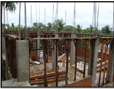
The beams for the third story of the new KBC Healthcare Clinic building are being set in place as of May 23, 2009.