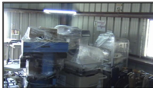
Anesthetic machine, incubators, exam tables, surgery tables and crutches were some of the medical equipment included in the container.

A forty foot container loaded with medical equipment and supplies worth $450,000, was organized by the Myanmar Burma Relief Organization (MBRO), an affiliated organization supported by FOB, with the collaboration of Project C.U.R.E. and Myanmar Geosciences Society (MGS) organization. The container was shipped from Tempe, Arizona to Yangon, Myanmar in September 2008.