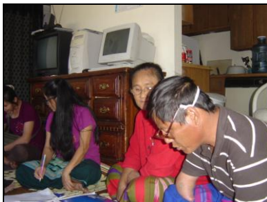
Tutoring time (English) for adults at Brairwood Apartment in Phoenix