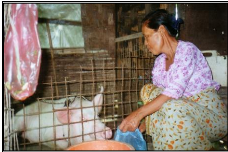
Raising livestock such as pigs and ducks projects are the most common and successful projects.

ACWA reported the progress of their project on 15 th October 2008. A 300,000Ks grant from FOB was received.