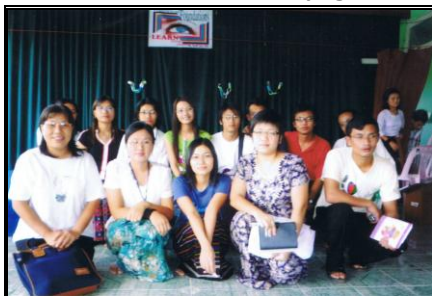
Some of beneficiarires from the KBC Taunggyi Youth Hostel .

Many KBC Taunggyi Youth Hostel students were beneficiaries of the 2008 Eyeglasses Program.