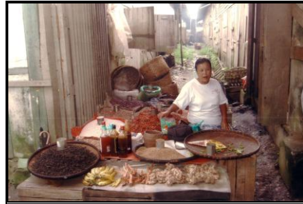
Dry goods including onion, garlic, chili, dried tea leaves and others are available at this grocery store.

NWA was initiated at late 2007 with six beneficiary members. Low interest loans were given out for seasonal crops, groceries and refining timber oil projects.