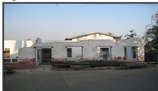
The long awaited new KBC Healthcare Clinic is now under construction and progressing very well. The final completion of the building is scheduled for the end of August 2009.

The renovation construction project for Karen Baptist Convention (KBC) Healthcare Clinic in Insein, Yangon is well underway and progressing accordingly to plan. The building construction permit was approved at the beginning of this year. The new three story facility will be completed by the end of August 2009.