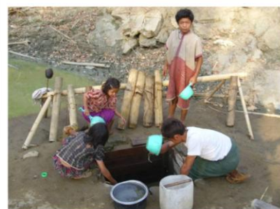
Sickness and disease is common because of poor water systems