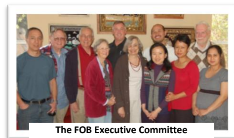
The FOB Executive Committee Annual Meeting - Feb, 2012