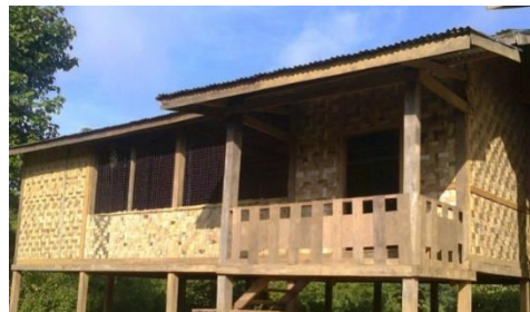
The new school at Pago Yoma sponsored by FOB

this happens so that the power of God could be seen ..." when asked by his disciples whether a man was born blind because of his or his parents' sin (John 9:3). The fact that the blind sight was restored – the pain was relieved - brought glory to God.