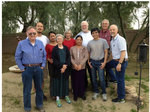
Executive Committee members at the annual meeting