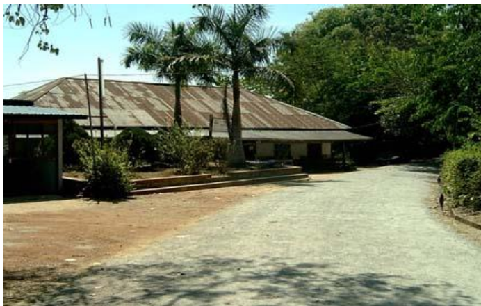
KBC Hospital in 1993

representing FOB in the healing ministry of Karen Baptist Convention Hospital (KBC Hospital) which had a rather humble beginning. KBC Hospital used to operate in what was little more than a shed. Now, it stands tall, offering various medical services at low costs to the people of Myanmar. In 2013, KBC Hospital treated more than 60,000 patients. The generous support from FOB included X-ray machine, power generator, hospital beds, operating room construction, an ambulance, and an elevator, among many items. When I visited Myanmar, I witnessed KBC staff providing medical services to patients from remote areas, children