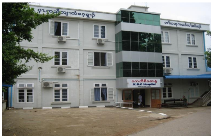
KBC Hospital in 2014

Our God has called us to love our neighbors and to be the light of this world. I strongly believe that the labor of love put forth by FOB is representative of the love and light of Jesus Christ. Isaiah 58:10 says, "If you pour yourself out for the hungry and satisfy the desire of the afflicted, then shall your light rise in the darkness and your gloom be as the noonday." Myanmar often falls in a dark place, where there are