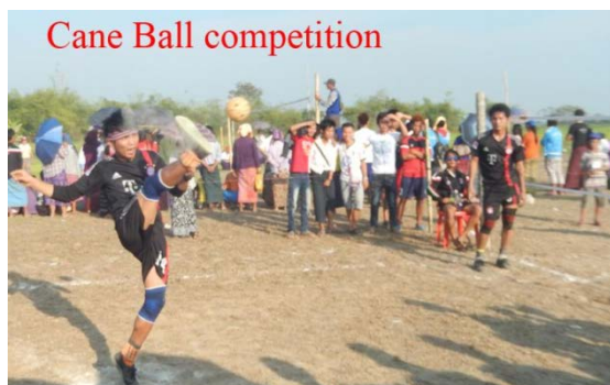
Cane Ball competition