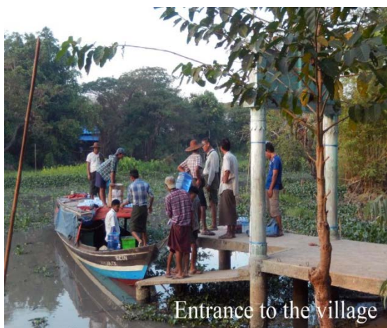
Entrance to the village