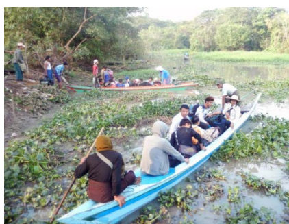
Dining is a pleasure