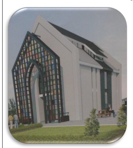
The design of the new KBTS Library Archive building

"Of all our national assets, Archives are the most precious; they are the gift of one generation to another and the extent of our care of them marks the extent of our Arthur G. Doughty, Dominion Archivist, 1904-1935