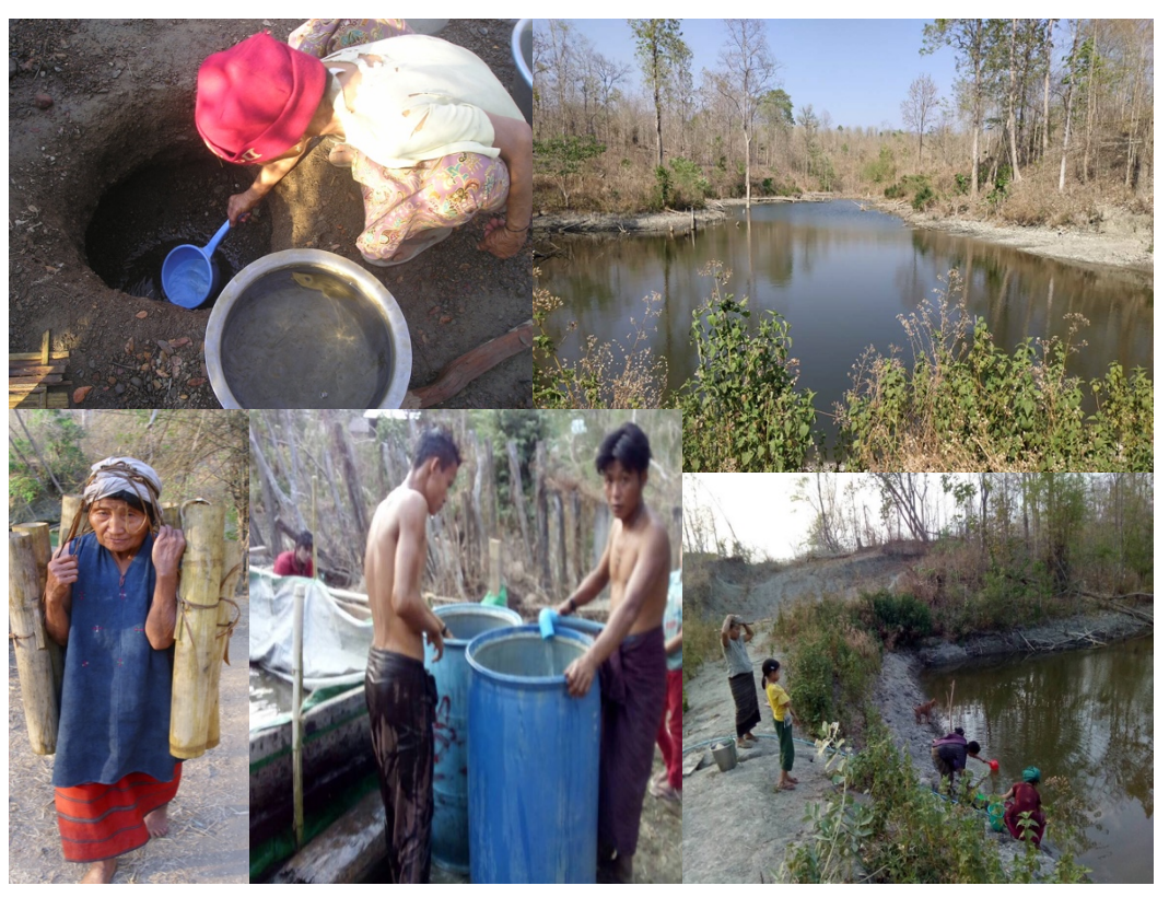
The struggles with water scarcity can be seen in the two pictures on the left. Now, there is water and the villagers also transport water through the pipes for the water to reach nearer to the neighborhood.

With summer comes extreme drought and water scarcity in Sin Zwe Village from the Bago Yoma Mountainous area. The difference in this year is that the water reservoir that FOB built is holding up and helping the villagers with their water needs. The livestock also gets to drink enough water this year. Previously, villagers had to wait for the water to come up tiny narrow wells and take a bath in water puddles that quickly dried up under the scorching heat of the unmerciful summer. Now, water fills the built-up dam between the two hills. A villager excitedly sent a message, "Praise God! By the grace of God, we don't have to worry about water for the first time." What a precious gift to Sin Zwe Village!