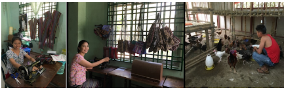
Sewing activities and chicken breeding at Hope Center

The women group is running for education support to the needy students. This year they can support 8 students in different classes and location. They try to get more technical skills in new materials. This year they take granted from some class which rent their room for bag sewing training which take a week. They get chance to learn without charges. So the 3 workers of Hope center gain new technical skill for each differently from that training. Now they are sewing things which they have learned from the trainers. Now they can make income for these sewing products. The capital for raw material is funded by FOB. Moreover in summer holidays the students from center help them in the activities of income generation.