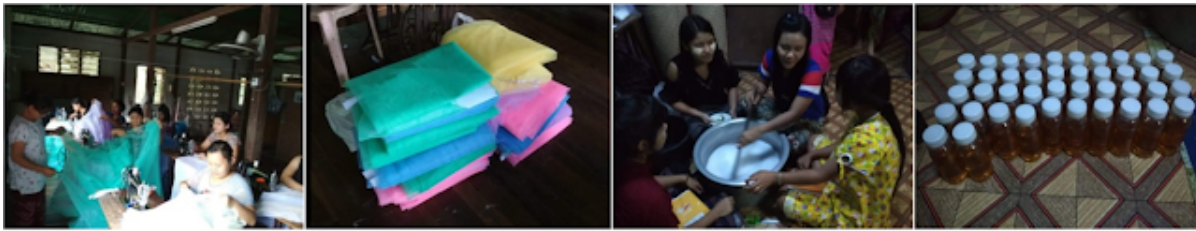
Mosquito net project