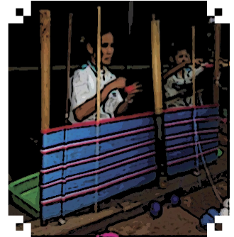
Self help groups doing weaving in two ways