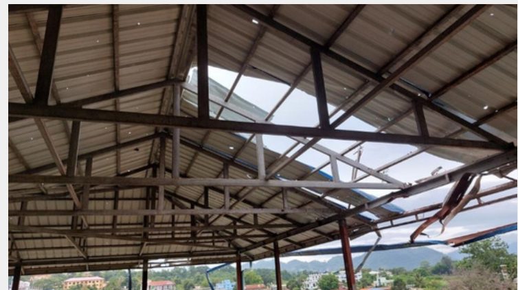
Damage from Gunfire and Bombs