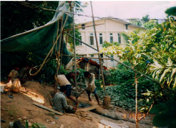
Digging tube well at KBC Clinic

LONG TERM PROGRAMS: Most of these ministries are supported by individuals' donations or undesignated donations.