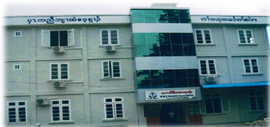
New KBC Clinic (above)