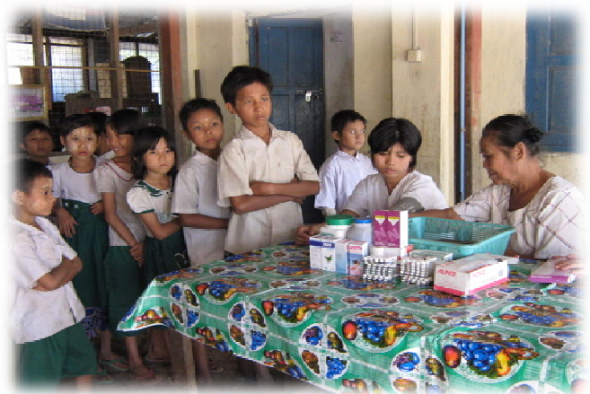
Children receiving medical checkup