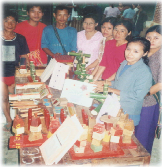
Educational toys made for pre-schools in Shwe Gyin