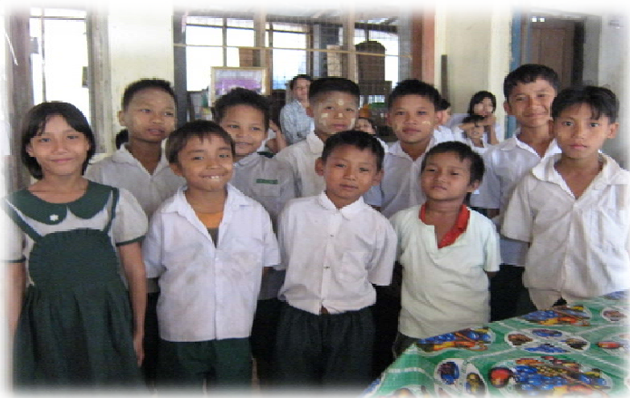
Children in need of care in school uniform

FOB also aids the Three Sisters' Orphanage, a Youth Hostel, and another orphanage connected with the Karen Baptist Church in Taunggyi, Shan state.