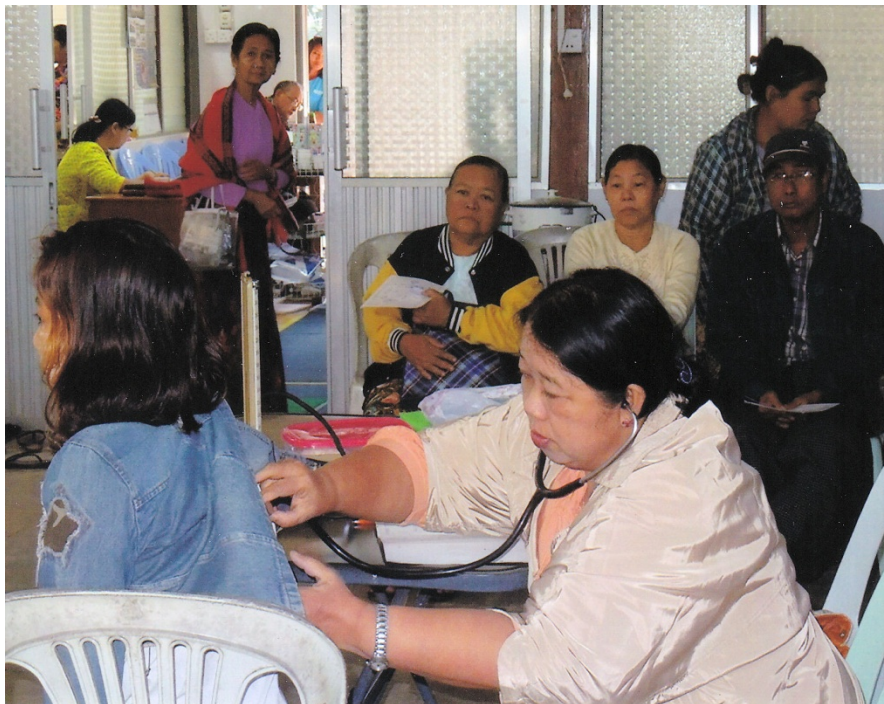
Ywama Charity Healthcare Clinic

We can send this newsletter to you in color if you give us your e-mail. Please feel free to pass on our newsletter to friends and to mention us on face book, etc. Friends of Burma, Inc is a non profit 501(c)(3) organization staffed in the U.S. by volunteers. Donations are tax deductible and less than 2% of income is used for mailings, overhead and the salary of one part time person in Burma. If you want to continue to do