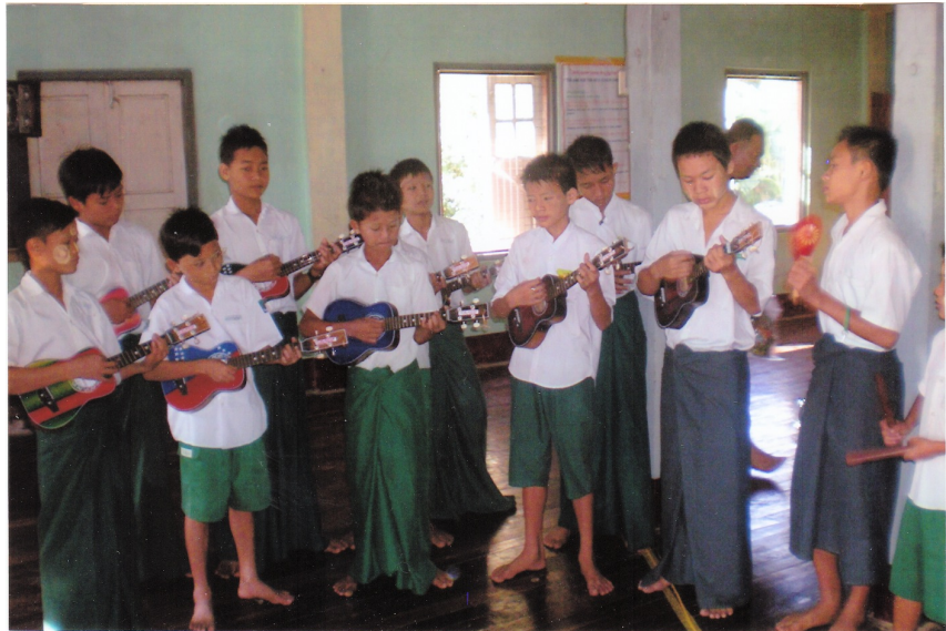
Musical Group at an orphanage.

It was 28 years ago I felt God called me to help the Christians of Burma. On one hand I was sad to remember so many leaders we have worked with have passed on. On the other we met so many new leaders who are so dedicated and competent who are a joy to know. How I wish each of you could have been with me and shared fellowship with these wonderful people. I thank God that so many of you have