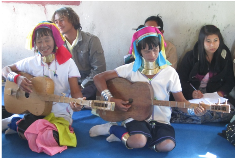
Padaung women learning the guitar. received “for most needed”.

students are chosen based on academic tests which are given to them.