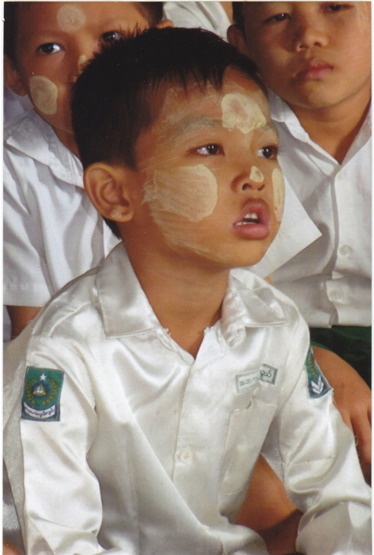
Orphan in Need of a Sponsor

If none of the above appeals to you, please check our website ( friendsofburma.org ) and see if any of our other 53 programs appeal to you.