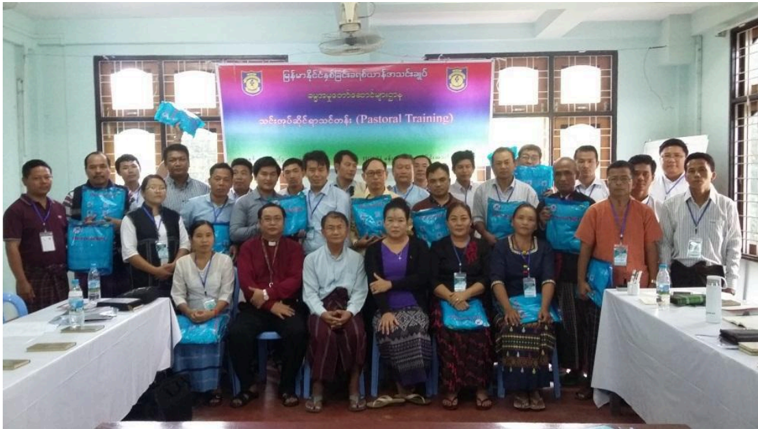
21 Ministers from Language and Regional Conventions who received mosquito nets.