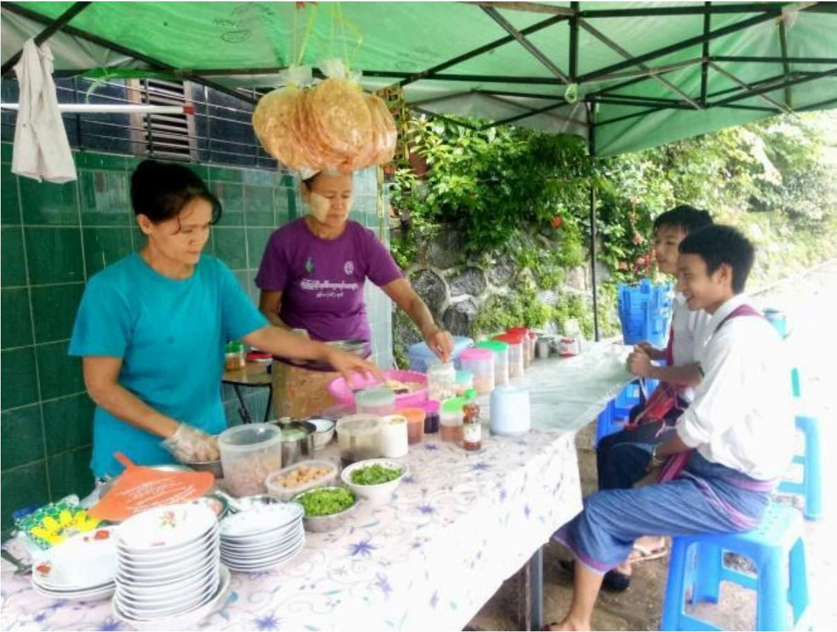
Woman's Entrepreneur Restaurant.