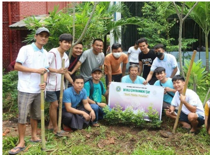
Activities on World Environment Day