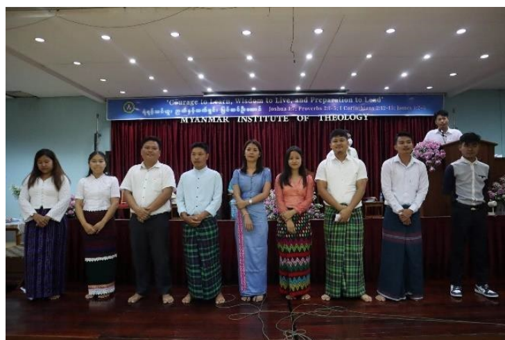
EC Members of Student Council (Theology)

More than 150 new students have been admitted to Theology Program for the academic year 2023-2024. While theology students have been taking classes both online and in-person, only online classes can be arranged, at present, for students of Liberal Arts Program (LAP). FOB scholarship has enabled MIT to financially support students with most needs from LAP, whose families could not afford to support them due to loss of jobs caused by both COVID-19 pandemic and the political crisis, totaling 284 students. In August, FOB was able to respond to the request for restrooms in the school library.