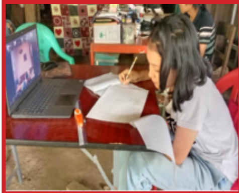
Final examination at Taunggu Center (Bago)