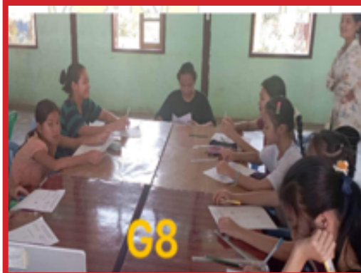
Students Parent group meeting