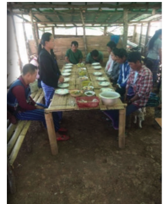
Adults praying before their meal