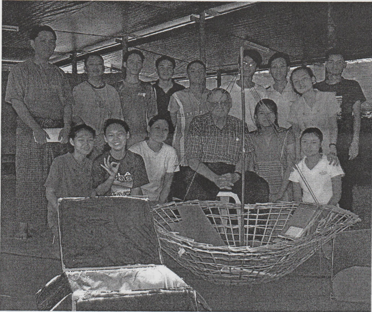
My Morning BA Students Class